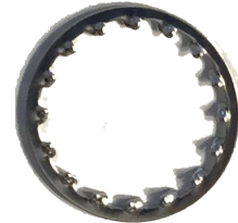
3. Threaded antenna nut